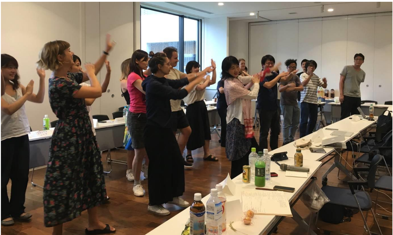
All workshop participants in dance practice

Another group reported from Ubusuna House , where the food produced by the local women and the way in which it is served to visitors in an old farmhouse, is an art project in which art and food are integrated and serve as a means for local pride among the village residents. The group had recorded a video with a local dance performed by the women in Ubusuna House, and all participants at the workshop joined in a reconstruction of the dance movements from the video.