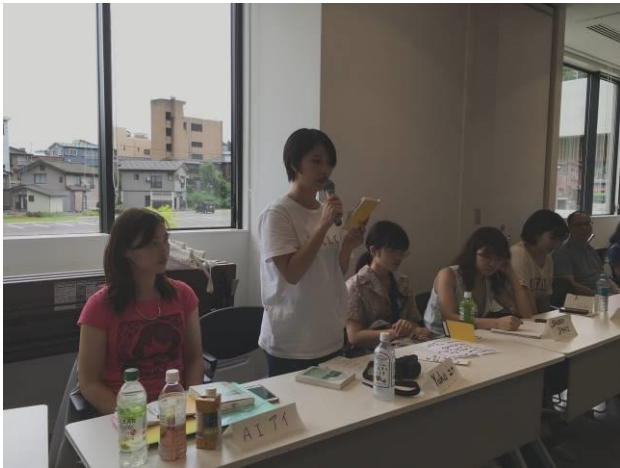
Presentations of fieldwork experience and discussion