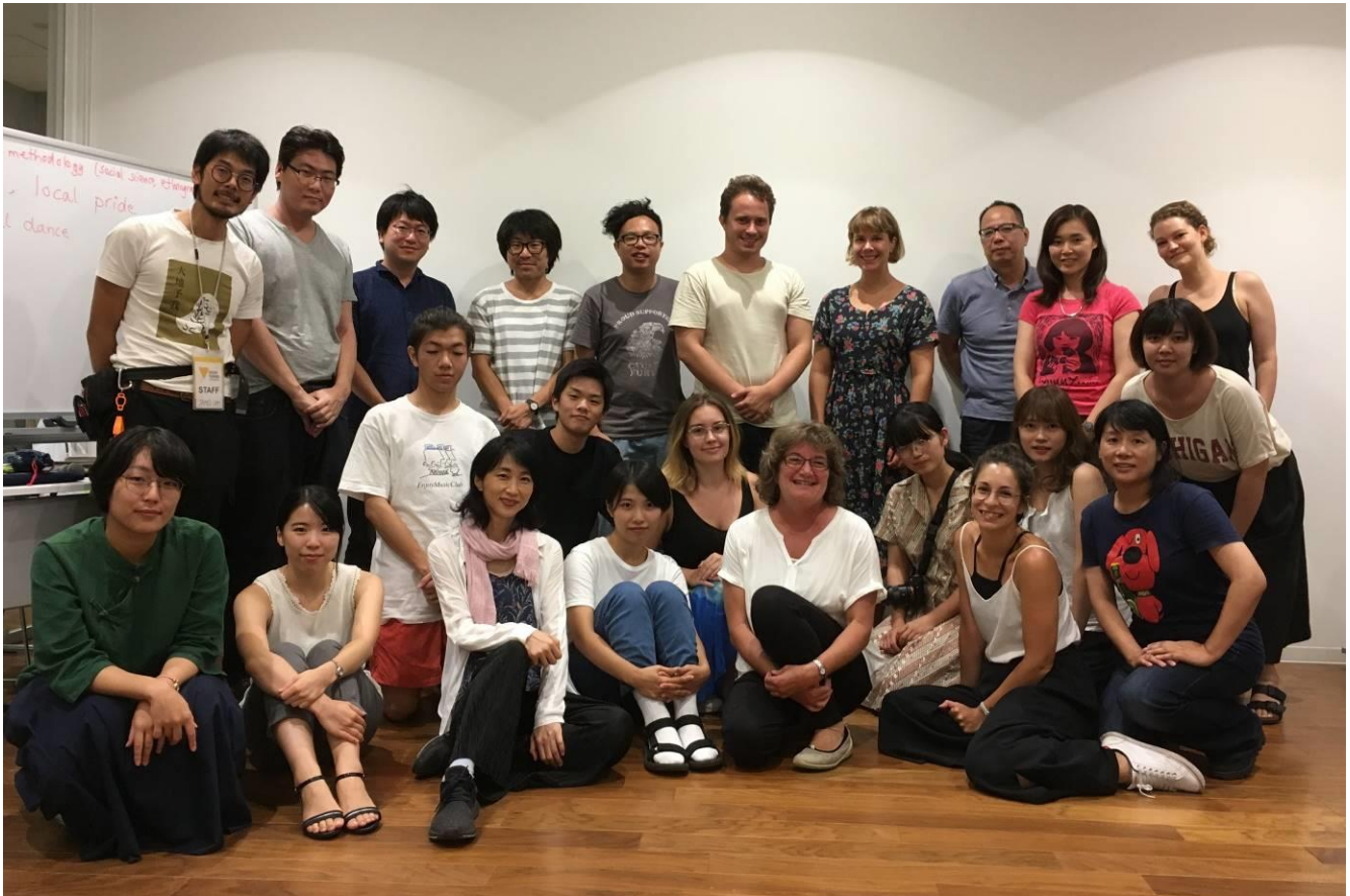
Group photo at the workshop