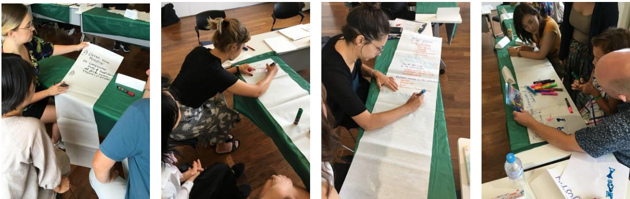
Image from workshop: production of posters with various fieldwork methods

The workshop participants formed smaller groups and each group would discuss and write down different methods or practices when engaging with site-specific and socially-engaged art projects on a poster. The various ideas were presented in plenum, and could be used as inspiration for the afternoon fieldwork trips.