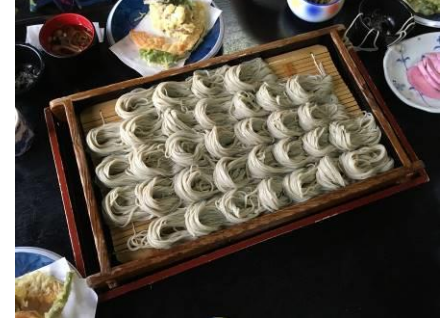
Dinner party at Soba House Yoshiya, Doichi