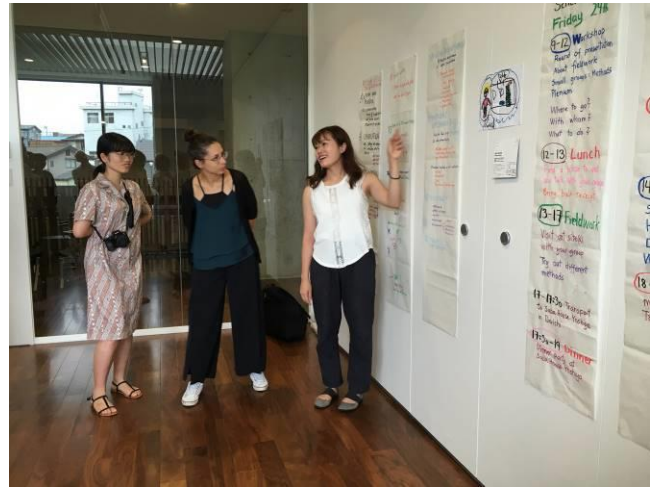
Presentation of posters with fieldwork methods

Smaller groups were formed and each group decided for one or several art sites to visit. Each group could go to a café or restaurant, some of them as a part of the art site, and continue discussions of research methods.